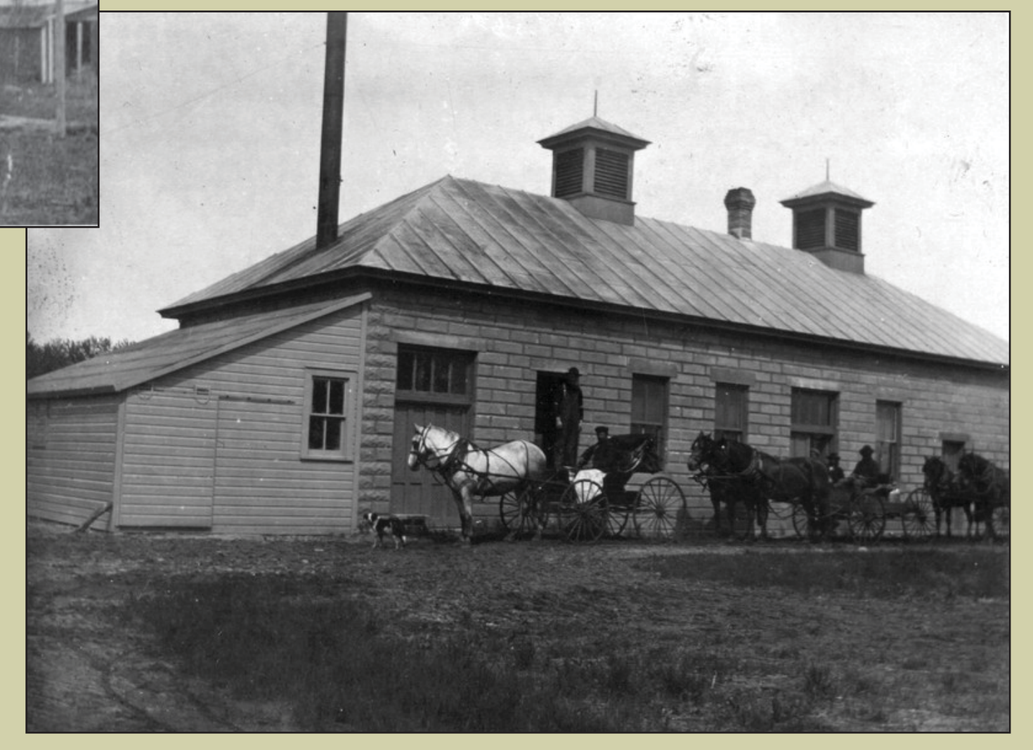
Lining up for milk delivery at the Newfolden creamery that was built in 1906.