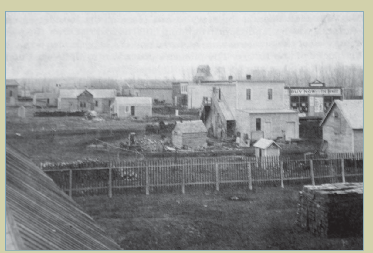
Looking east from the roof of the Bovey Shute Lumber Company. The Newfolden Post Office is the largest building at the center left.