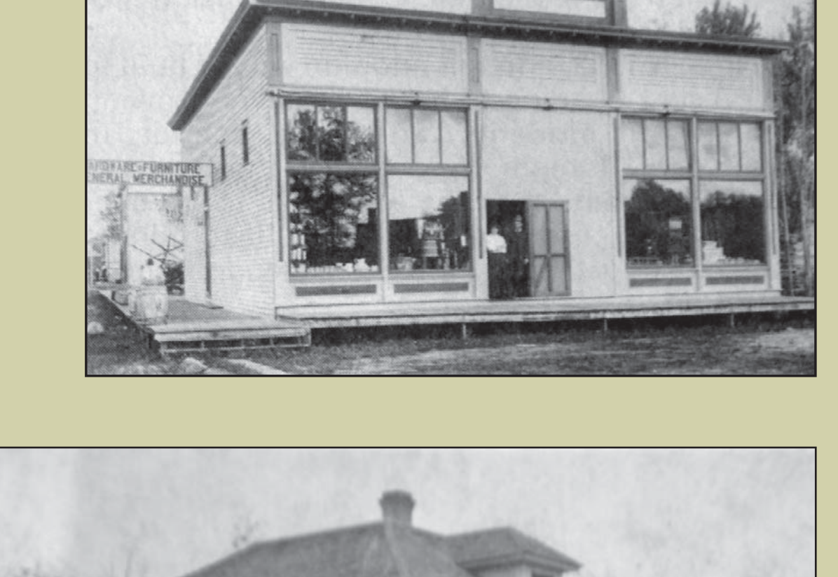
Exterior (above left) and interior (above) of Hoberg Store. Circa 1905.

Excerpt from Cherishing the Past Challenging the Future, The Newfolden Centennial, 2004.