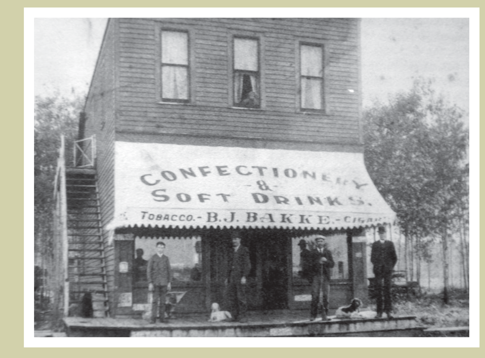
At its new location in Newfolden, the B. J. Bakke Confectionery, soft Drinks, and Drug Store in 1905.

Businesses sprang up as settlers moved to New Folden Township. Country stores were a great convenience, as they provided for daily necessities and an outlet for eggs, butter and milk which were bartered for other groceries.