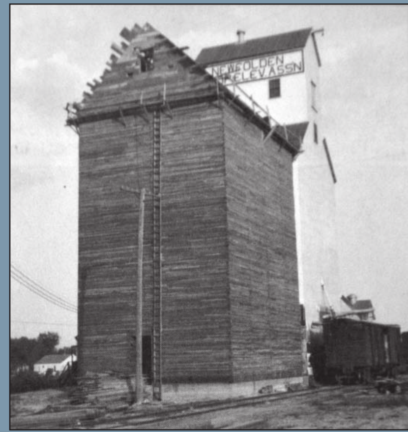
New elevator under construction in the 1950s.

Wheat, oats and barley were the most common grain crops grown in the area. Elevators were instrumental in providing a central location where farmers could bring their grain and store it until it could be transported to markets in larger cities. In addition, the elevators sold coal, fertilizers, seeds, animal feed, pesticides and herbicides. The elevators were also equipped to clean the grain, which was a major convenience for the farmers. Grain elevators were constructed along transportation routes. In Newfolden the Soo Line Railroad was a major transportation artery between Minneapolis and Winnipeg. Construction of the elevator coincided with the arrival of the railroad.