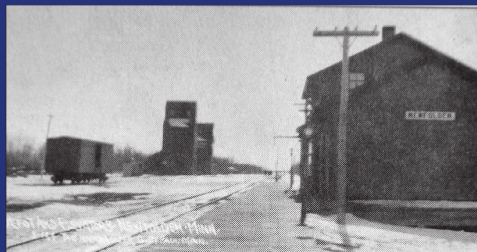
The depot and grain elevators. Circa 1906.