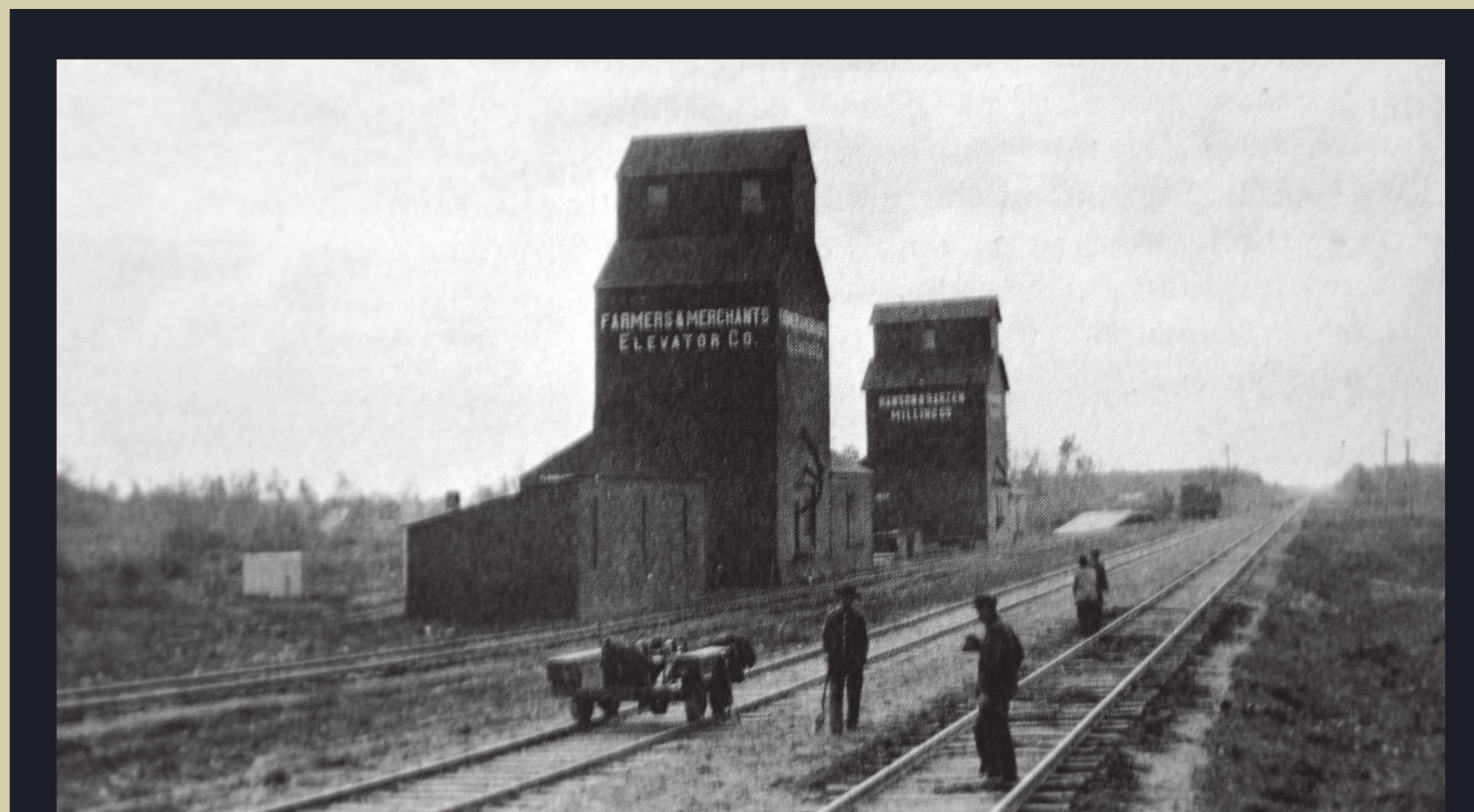
Looking south at the Farmers & Merchants and the Hanson & Barzen Elevators. Circa 1912.