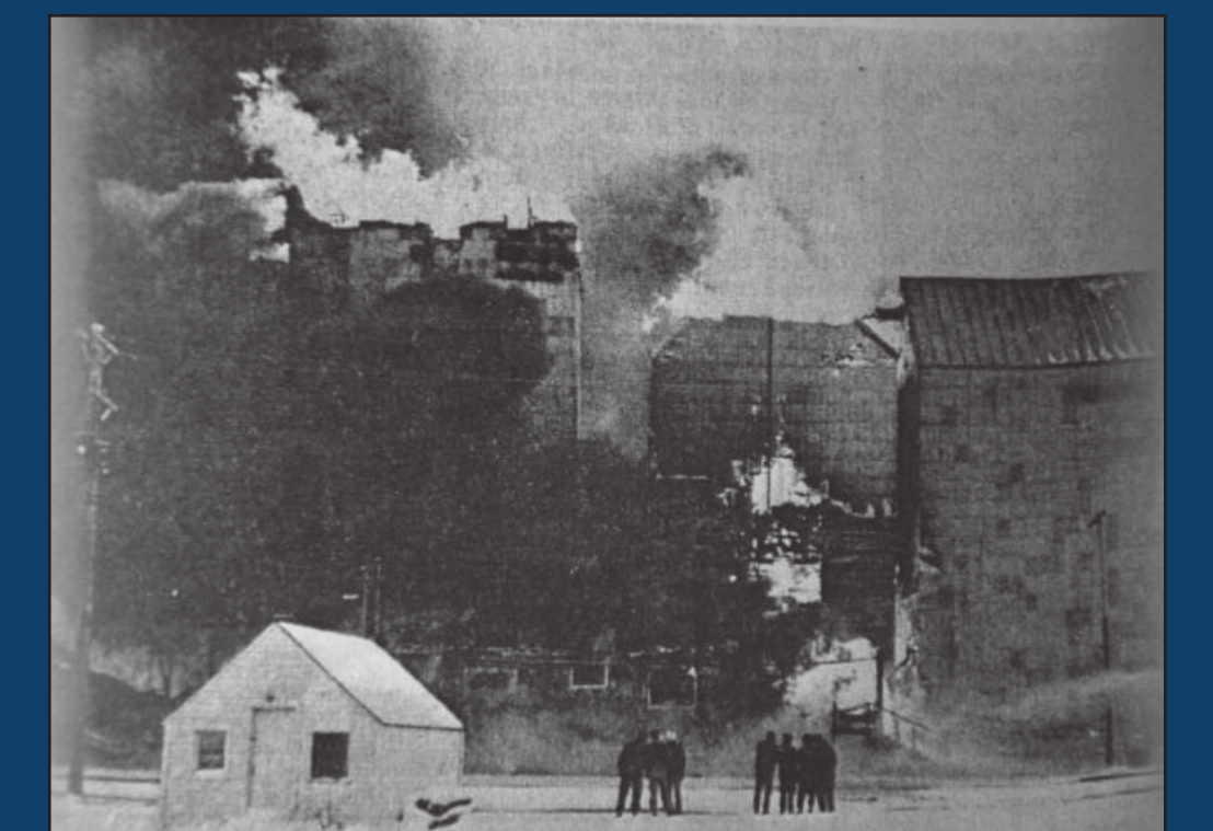
The fire in 1972 was thought to have started in the office area.