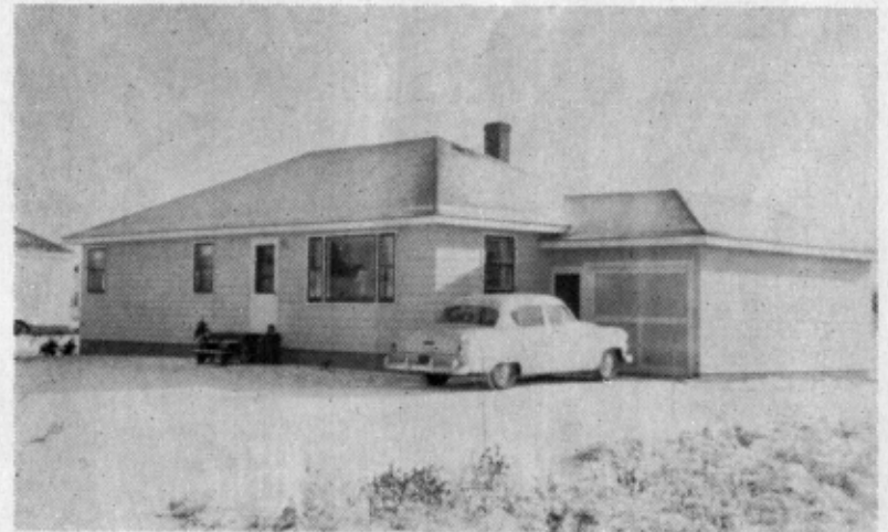
The Parsonage BUILT IN 1953