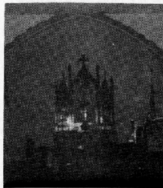
CHURCH INTERIOR, 1984

1976. The Bethania congregation purchased approximately one acre of land adjoining the church yard and cemetery on the north, west and south sides.